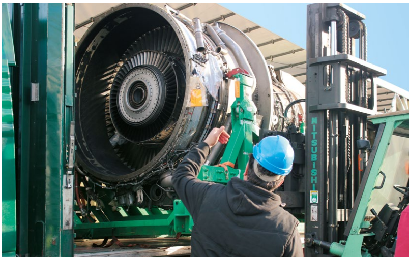
Delivery of an engine