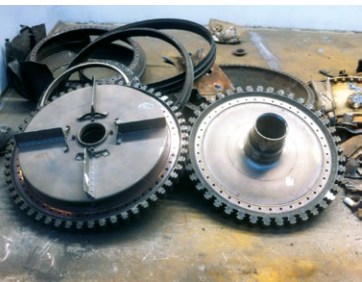
Discs from the fan intake of an engine

When serialised aircraft components are rendered unusable, it is important to pay attention to ensure that the destruction of the materials is verifiably documented. This is necessary because these components have only been designed for a certain running time or number of revolutions or landings and must therefore be taken out of circulation after the specified running time.