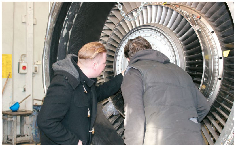
Technical dismantling discussion on a commercial engine