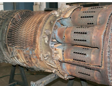
Combustion chambers in a military engine

Initial experience has already been gained even during the implementation of the process for engine and landing gear recycling at CRONIMET. Reliable information was compiled on the range of commercial and military engines available. This study was divided into Europe (Karlsruhe collection point), North America and Asia. In addition, many tests were carried out on the dismantling, analysis, destruction and recycling of various engine